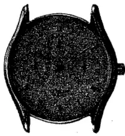
(Cal. No. 4300※)