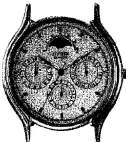
(Cal. No. 4310※)